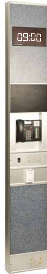
12" CONTROL PANEL