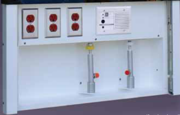
vertical artwall console