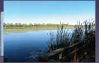
horizontal artwall console

ACCENT Series Artwall Consoles conveniently conceal medical gas and utility outlets behind a moveable cover that mounts your choice of fine art. Ideal for use in private clinics and extended care facilities, ACCENT Artwalls offer a tasteful decorative display while also providing a tamper-proof, lockable cover that limits unauthorized use. They can be configured in a variety of ways to also bring communications and power outlets to the patient's location.